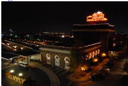
The Choo Choo Hotel at night

Georgia Polar Bear Run XII the TN Polar Bears have their wish – GA Triumph Association are organizing another overnight event and it's a return to Unicoi Lodge after a scenic drive to Helen GA. Full details shortly but mark your calendars now – join us for a fun way to bring in the New Year including a dip in the lodge lake if you are brave (stupid?) enough. The