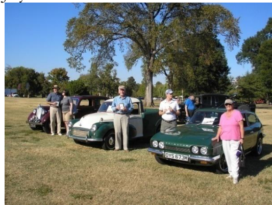
Three club Members (with awards) 2010