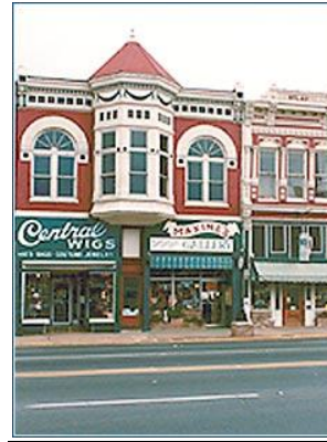
Part of the historic downtown Hot Springs, Arkansas.

If you are intending to visit this show please let us know.